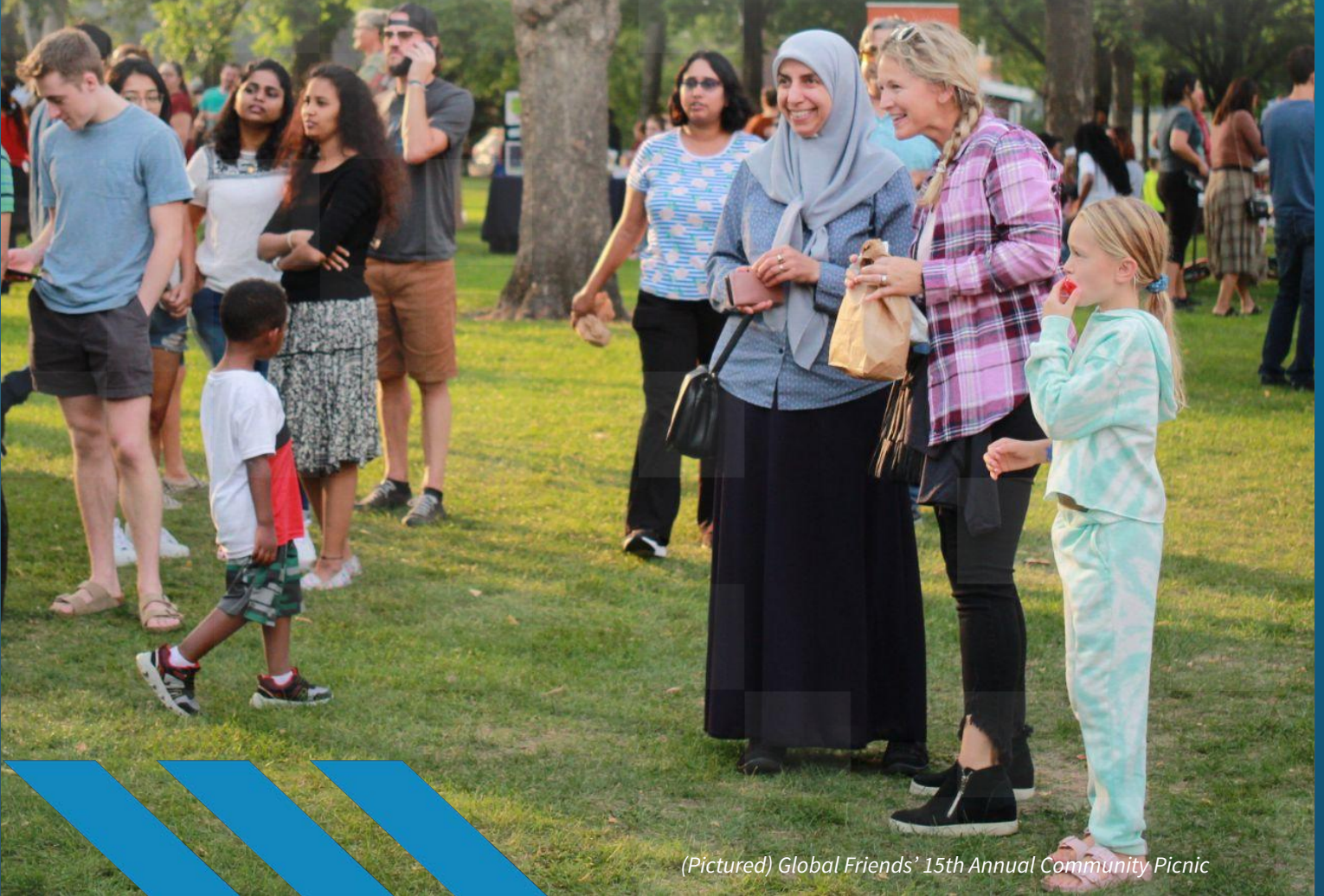
(Pictured) Global Friends' 15th Annual Community Picnic