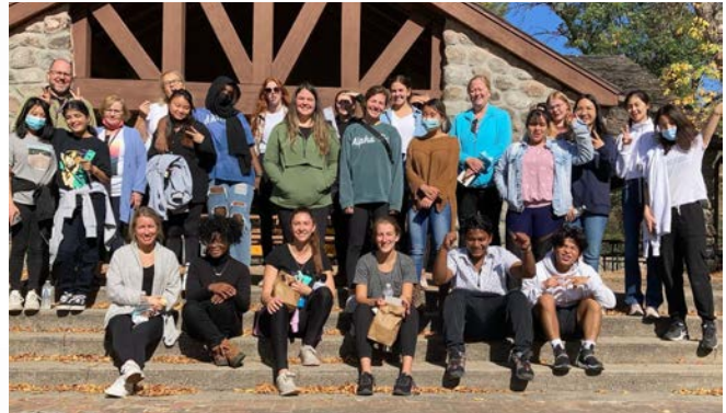
Global Friends sponsored field trips for EL students to visit Turtle River State Park

New American youth are matched with mentors and/or tutors to develop their English skills, provide academic support, develop leadership skills, and cultivate confidence.