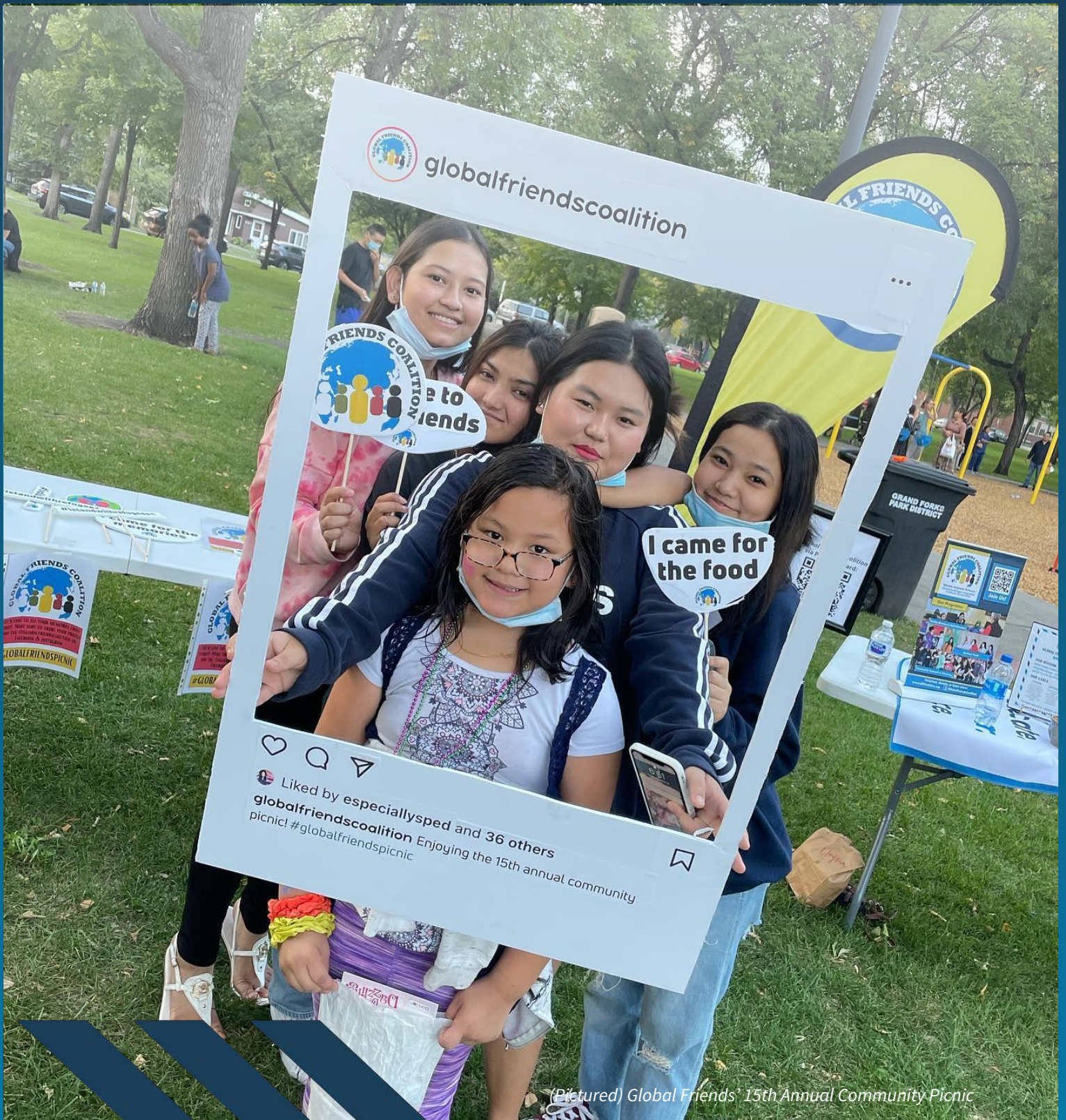
(Pictured) Global Friends' 15th Annual Community Picnic

For more information, to volunteer, or to request a volunteer: