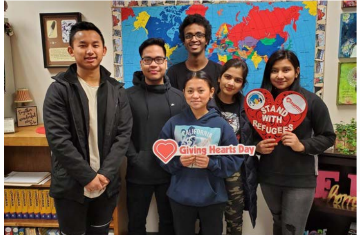
Red River High School EL students celebrating Giving Hearts Day

We continued to diversify our revenue streams, even throughout the pandemic.