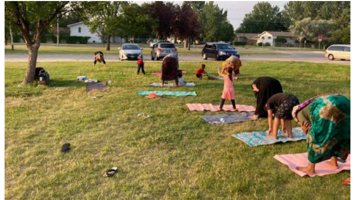
An outdoor yoga class held near Century Elementary School.

Classes include basic English, U.S. citizenship interview preparation, driving, and this year, yoga.