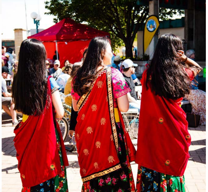
(Above) Students originally from Nepal watch World Refugee Day programming on the stage.