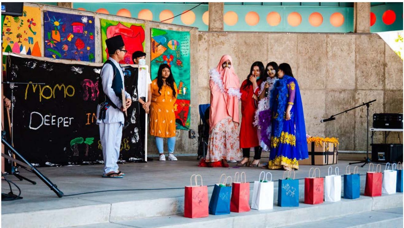
(Below) High school EL students perform a play written and directed by Kathy Coudele-King at World Refugee Day