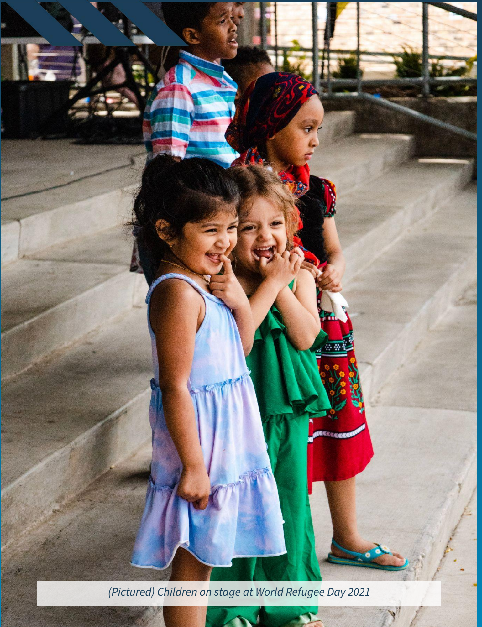
(Pictured) Children on stage at World Refugee Day 2021