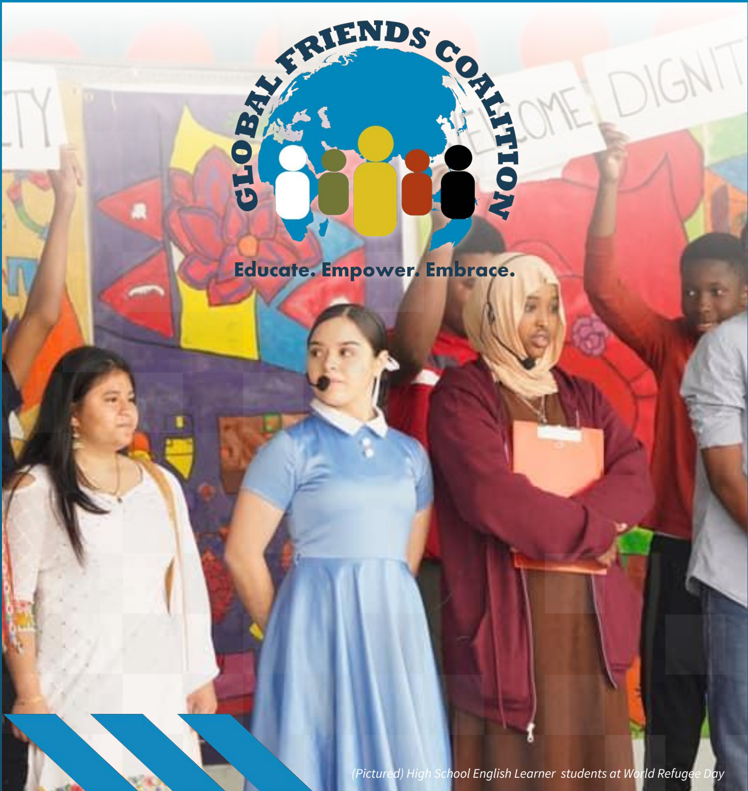
(Pictured) High School English Learner students at World Refugee Day