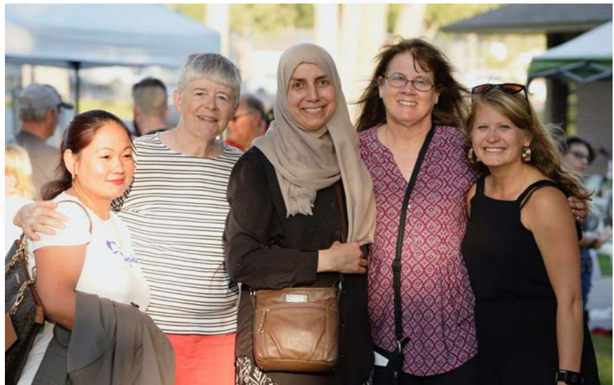
(Pictured) Attendees at our 2022 Community Picnic