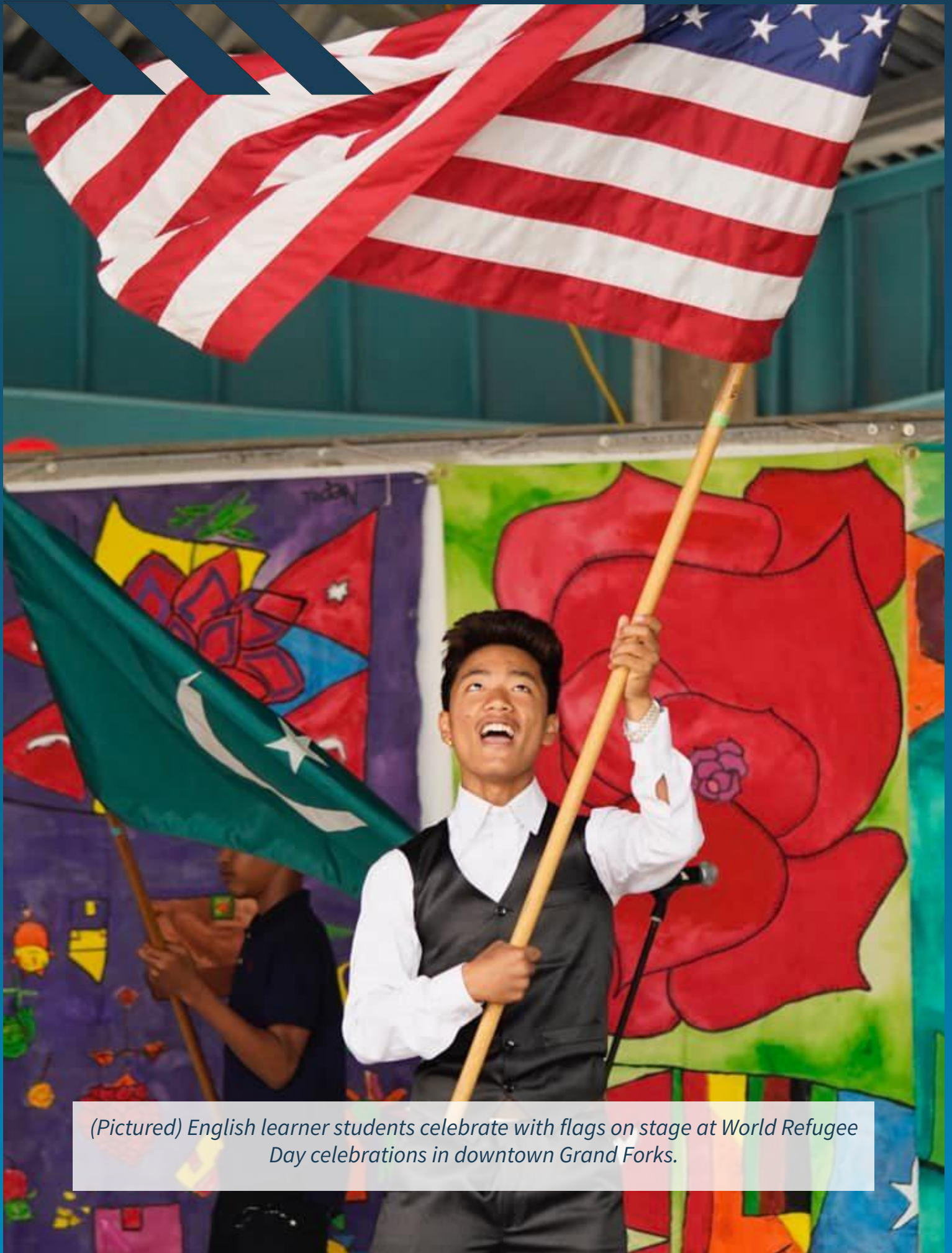
(Pictured) English learner students celebrate with flags on stage at World Refugee Day celebrations in downtown Grand Forks.