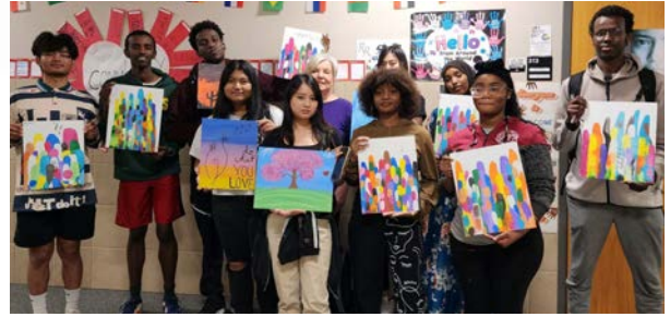
Red River HS EL students with their art.

The core of our work since 2008, our integration programming, made up of our three traditional programs, continued to directly serve over 150 New Americans in our community through in-home, in-school, and community-wide initiatives.