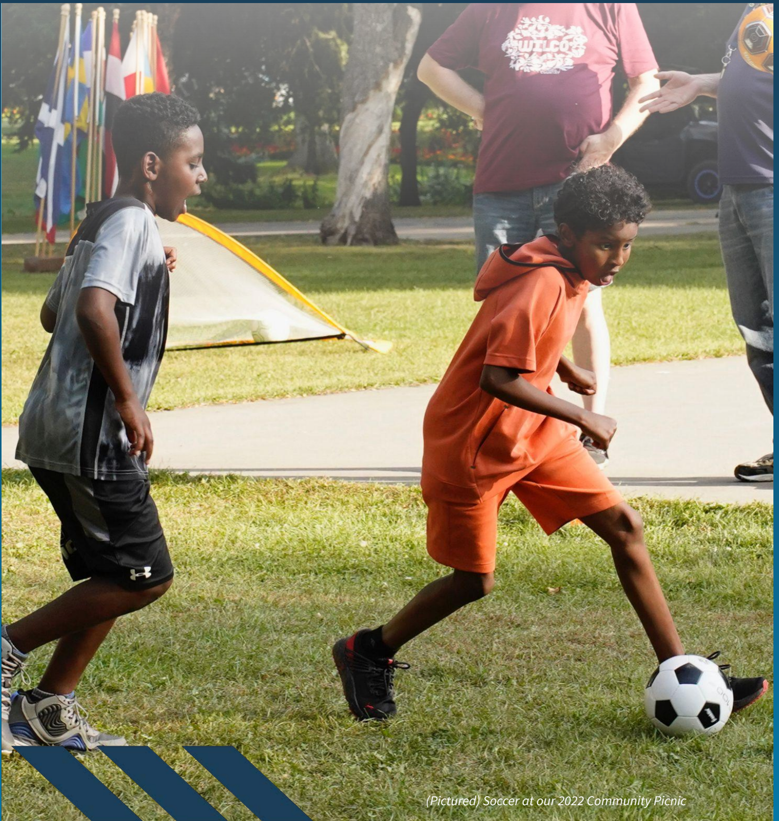
(Pictured) Soccer at our 2022 Community Picnic